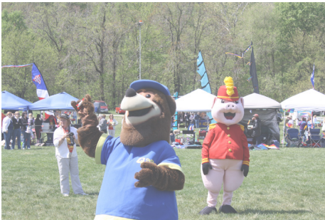
A few characters out flying a kite at the 12th Annual Blue Ridge Kite Festival