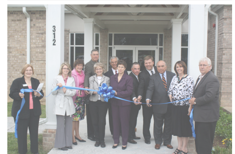
Blue Ridge Autism & Achievement Center celebrated Autism Awareness Month on April 27, 2010 with a ribbon cutting and open house. The center is located off of Peters Creek Road in North Roanoke.