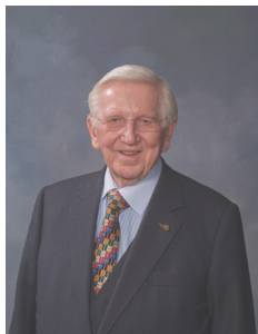
Cabell Brand Lifetime Achievement Award